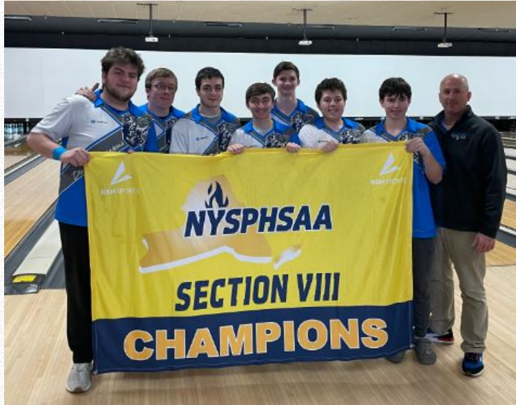
Division Avenue Boys Bowling Nassau County Champions