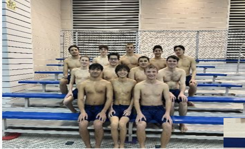
District Boys Swim Four Students - State Qualifiers