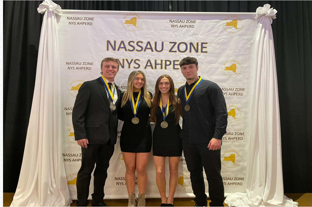
Outstanding Physical Education Students