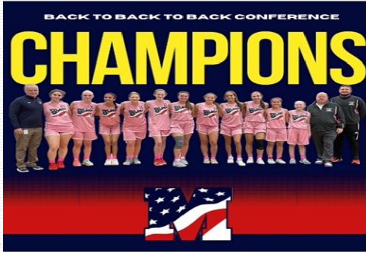
MacArthur Girls Basketball 2X Conference Champions